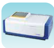
UV/VIS Spectro 2080+ Double Beam

Analytical Technologies is synonymous for offering technologies for doing analysis and is the Fastest Growing Global Brand having presence in at least 96 countries across the global. Analytical Technologies Limited is an ISO:9001 Certified Company engaged in Designing, Manufacturing, Marketing & providing Services for the Analytical, Chromatography, Spectroscopy, Bio Technology, Bio Medical, Clinical Diagnostics, Material Science & General Laboratory Instrumentation. Analytical Technologies, India has across the Country operations with at least 4 Regional Offices, 6 Branch Offices & Service Centers. Distributors & Channel partners worldwide.